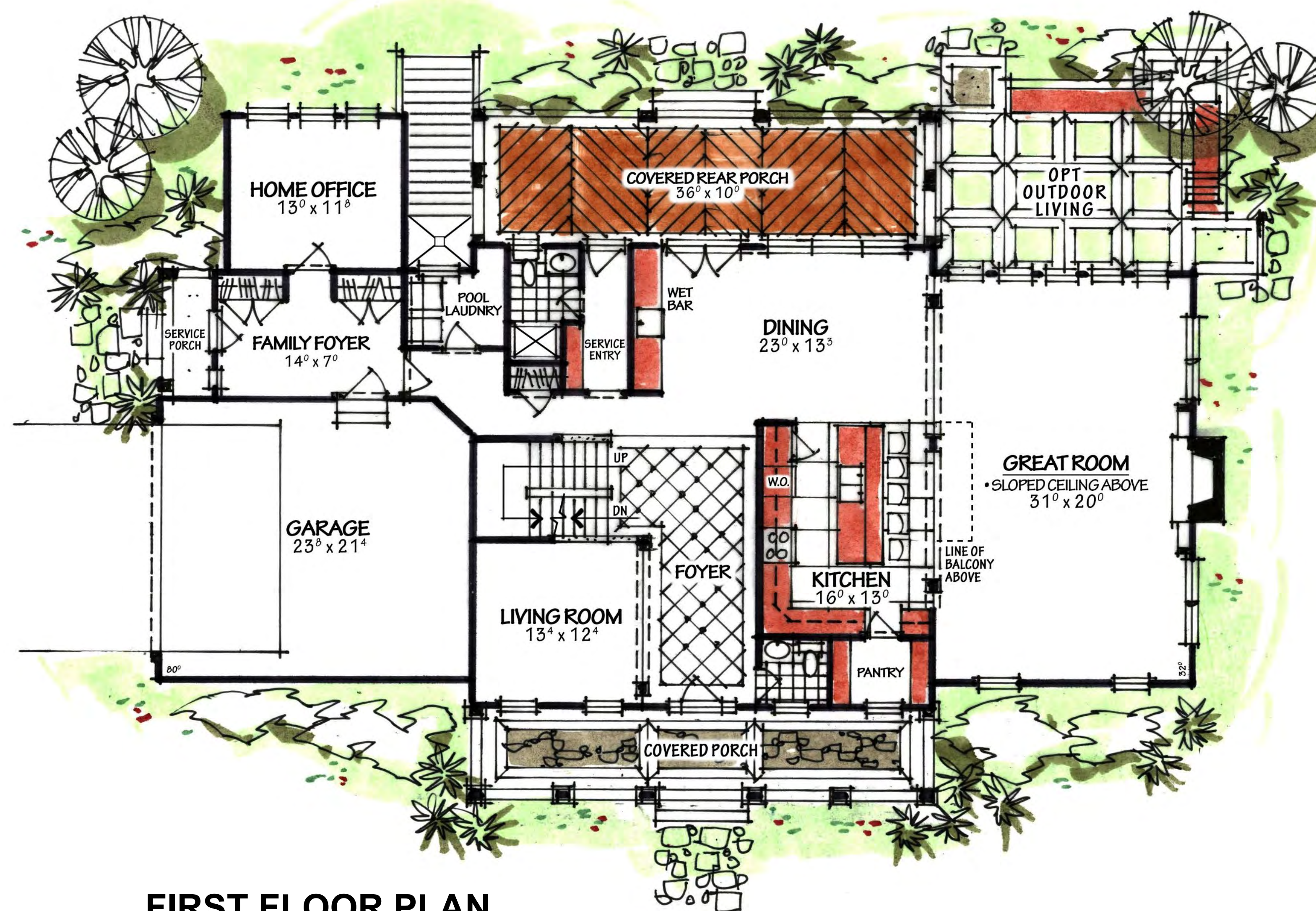
FIRST FLOOR PLAN (2,314 S.F.)